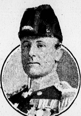
LORD JELlicoe. The Admiralty have announced the retirement of Admiral Lord Jellicoe, effective December 5th. He commanded the British Grand Fleet in the battle of Jutland.