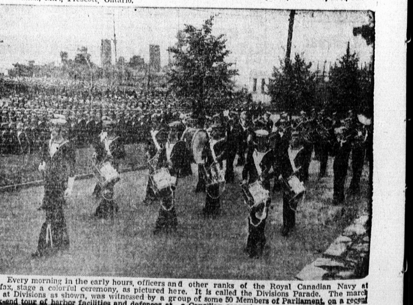
Every morning in the early hours, officers and other ranks of the Royal Canadian Navy at Halifax, stage a colorful ceremony, as pictured here. It is called the Divisions Parade. The march past at Divisions as shown, was witnessed by a group of some 50 Members of Parliament, on a recent weekend tour of harbor facilities and defenses at a Canadian seaport.