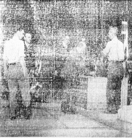
Senator W. D. Euler is here seen laying the corner-stone of the $250,000 Aerodynamics Building at Ottawa, which will be completed this fall. Much of the credit for the erection of the building should be given to Lieut.-General A. G. L. McNaughton, president of the Research Council, said one of the speakers.