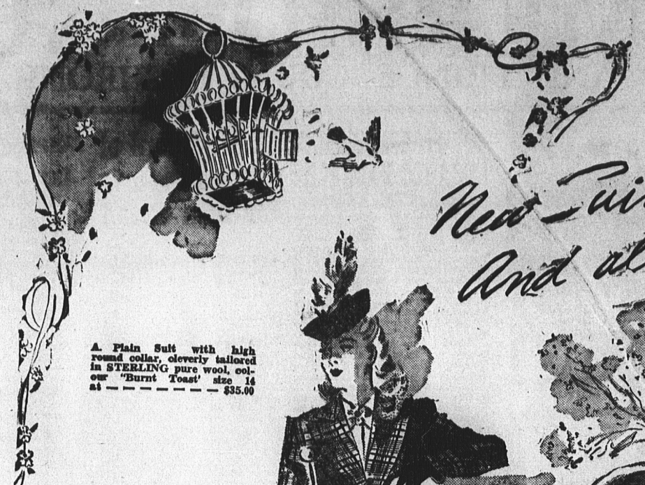
A. Plain Suit with high round collar, cleverly tailored in STEELING pure wool, color "Burnt Toast" size 14 at ———— $35.00

The Cape Traverse Young People's Union held at Valentine Social at held their regular monthly meeting