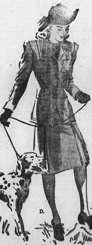
D. Sky blue, pure wool suit with that wonderful Scottish feel to it. This suit has also a matching top coat, suit can be bought with or without top coat, size 14. Suit is $35.00. Topcoat $35.00. Complete outfit for ———— $70.00

New Suits for Now... And all there Spring