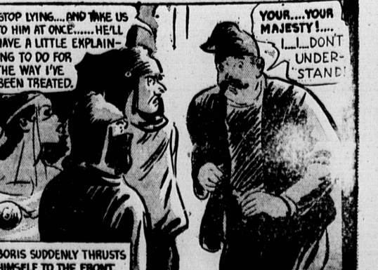
BORIS SUDDENLY THRUSTS HIMSELF TO THE FRONT.