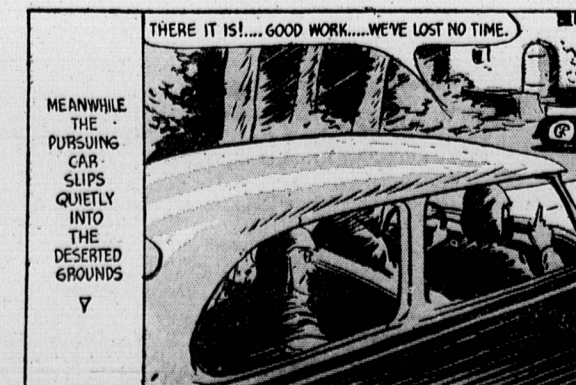
MEANWHILE THE PURSUING CAR SLIPS QUIETLY INTO THE DESERTED GROUNDS