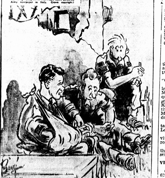
"Broke it tryin' to spread this new kinda margarine!" PERFECT MODELING!