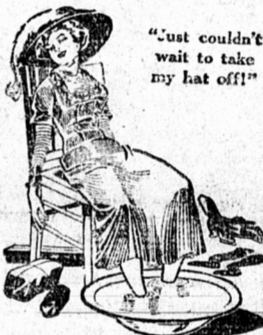
"Just couldn't wait to take my hat off!"

HOW "TIZ" EASES SORE, SWOLLEN, SWEATY, CALLOUSED FEET AND CORNS.