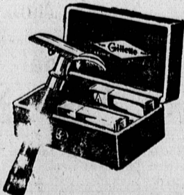
Standard Set No. 460 The original leather case $5.00