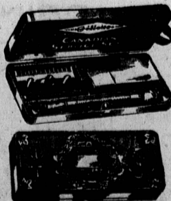
Canadian Service Set No. 20 Pocket Edition Gillette in Nickelled Metal Case, embossed with Army and Navy Insignia $5.00

Ask your jeweler, druggist or hardware dealer to show you these and the other Gillette Sets.