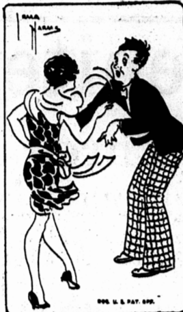
"The man who collects statistics about women can seldom lay his hands on them."