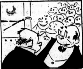
"Those two pugilists are liable to be arrested before they get much further." "For fighting?" "No. For being loud and boastful."