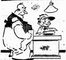
"Somebody wants us to answer the question, 'What makes a woman beautiful?'" "Say that we can't recommend any special make of face powder."