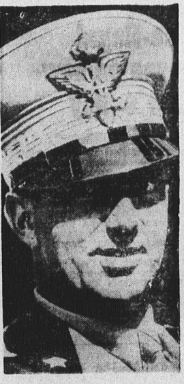
SAID INTERNED Reuters News Agency in a dispatch from Athens says that Italian non-commissioned officers who surrendered in Albania stated the Italian troops believe that Crown Prince Humbert has been interned by the Fascists somewhere in northern Italy.