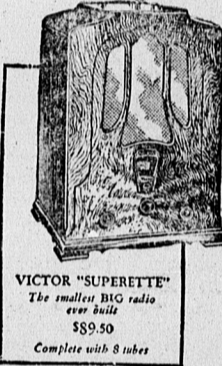
VICTOR "SUPERETTE" The smallest big radio ever built $89.50 Complete with 8 tubes

Your Victor dealer will give you a convincing demonstration of the Lowboy and the other new Victor models... the Hightoy, $122.50, complete with tubes... the Victor Radio-Electrola, RE-40, $169, complete with tubes... and the "Supercette" the smallest big radio ever built, only $89.50, complete with tubes. Easy terms.