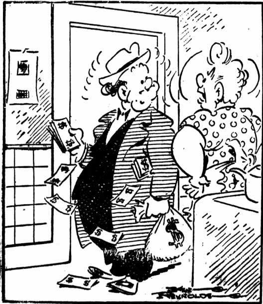
"Those Guardian Want Ads you're using are sure playing hob with our estimated income tax!"