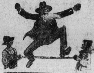
See! That there stuff (Nuxated Iron) acts like magic. It certainly puts the ginger of youth into a man.

"Iron is absolutely necessary to enable your blood to change food into living tissue. Without it, no matter how much of what you eat, your food merely passes through you without doing you any good. You don't get the strength out of it, and as a consequence you become weak, pale and sickly looking, just like a plant trying to grow in a soil deficient in iron. A patient of mine remarked to me (after having been on a six weeks' course of Nuxated Iron), 'Say, Doctor, that there stuff is like magic.'"