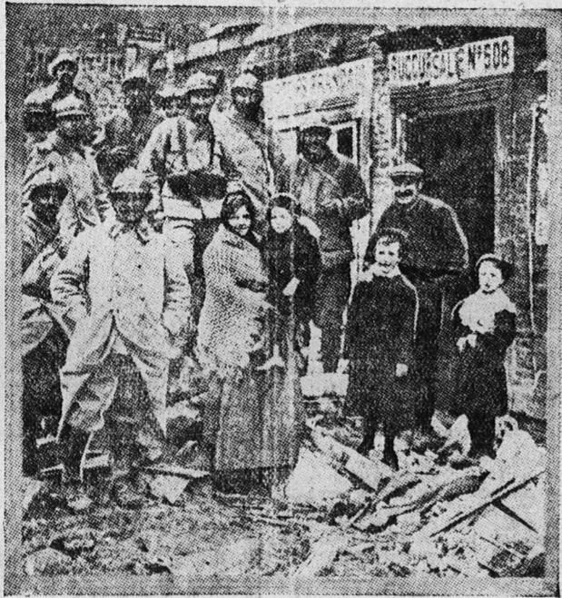
—FRENCH SOLDIERS IN THE TOWN OF ROYE.