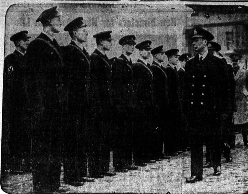
His Majesty the King is shown in this picture, taken several days ago during his visit to the Plymouth naval command, reviewing a number of Polish naval cadets. Her country overrun and partitioned by Germany and Russia, Poland is still very much alive as a nation, with a new Government functioning in a temporary capital in France, a new army in training and a small naval force which succeeded in escaping from the Baltic, co-operating with the Royal Navy.

If the Liberal party is returned there will be a regular session of Parliament opening in April, the Prime Minister said.