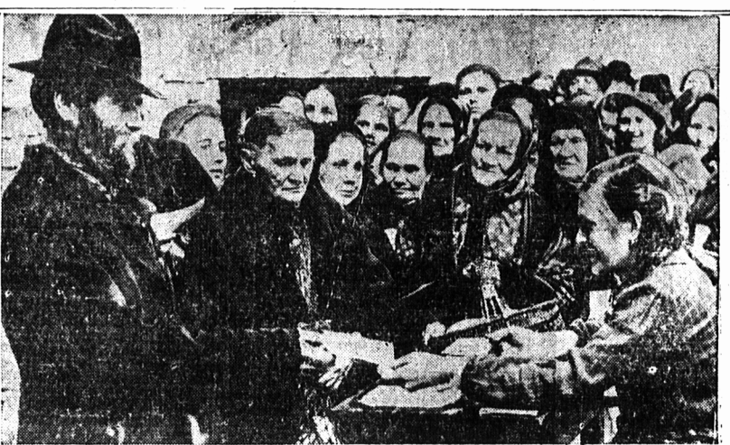
Berlin residents have to present ration cards for verification. In line to have their ration cards inspected, these residents of Berlin are shown handing the cards over to a young government employee, right, for verification, before they can purchase foods.