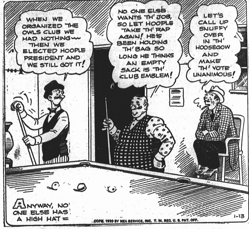
T. M. REG. U. S. PAT. OFF.