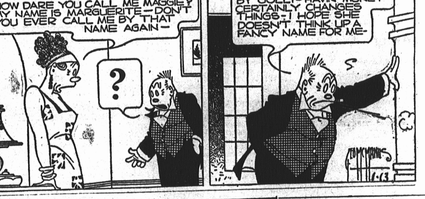
1939, King Features Syndicate, Inc.