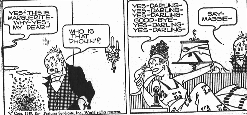
1939, Kir. Features Syndicate, Inc. World rights reserved.