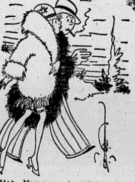
He: You seem to think money grows on trees. She: Well, the guys who have it are "poplar."