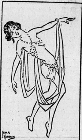
"The girl who is constantly on her toes is usually well heeled."