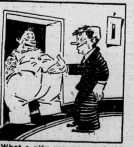
"What a pity you were not able to keep your piano." "Yes; it was too big to hide when they called to take it away."