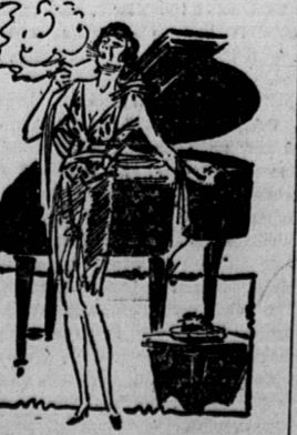
THE NEW QUALIFICATION A maiden who's name was Miss Hett Aspired to society's set And I'll whisper to you, Success came to her through The ad. of a now cigarette.

here before we were out of the ice. Foolish talk!" McDonald's twisted features relaxed. "You're right, John, right. It can't be done. We've got too much at stake."