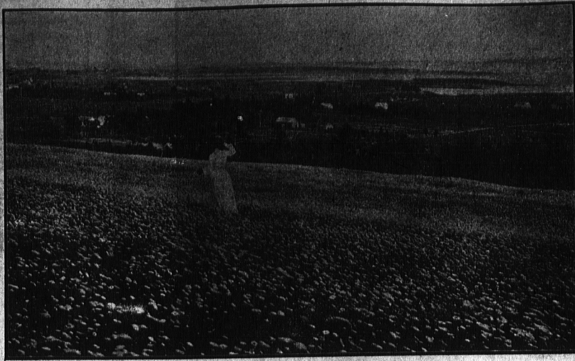
"As Others See Us"—TEA HILL, POWNAL—See Page 1.