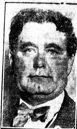
Senator Wm. E. Borah, above, in an address last week declared that there was no just reason for the United States to give up war debt collection. He said the generosity of the United States toward foreign governments during the great war had "no parallel" and added that the attitude of the debtor nations would cause the Senate to reverse its decision and reject the world court if it were voted on today.

(Canadian Press) LEHRTE, Germany, Aug. 19.—Nineteen persons were killed and five seriously injured early today when the Berlin-Cologne express speeding at 50 miles an hour was derailed near here.