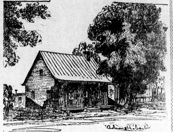
The house in which the late Sir Wilfred Laurier was born, shown above, at St. Lin. Que., has been purchased by the Dominion Government and will be maintained as a historic monument in memory of the French-Canadian leader who was Prime Minister of Canada from 1896 to 1911.