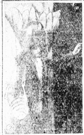
Eagerly awaiting official detailed announcements of tariff concessions to be made the United States in return for its offer to consider preferences on 1,000 items last week are people not only of Great Britain but the 50 crown colonies, protectorates and mandates involved. Typical of the wide variation of native types in countries to be affected are the girl of Ceylon in (1), and Gibraltar, where bread is delivered (2) by basket-carrying boys, will both be included