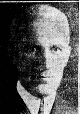
MAXIME RAYMOND, of Montreal, member of the House of Commons for Beauharnois-LaPrairie, is mentioned as Canada's next Minister to France.