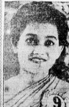
WHAT'S IN A NAME?