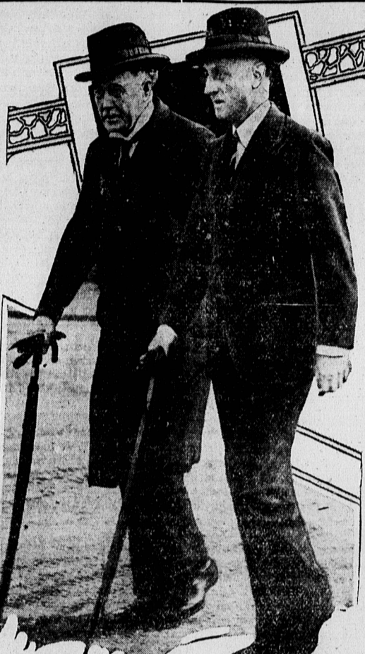
FILL VACANCIES IN BRITISH CABINET

Sir John Gilmour, the new home secretary, and Sir Samuel Hoare leaving Downing St. after the British cabinet meeting, at which the vacancies caused by the Liberal-Labor desertions were filled.