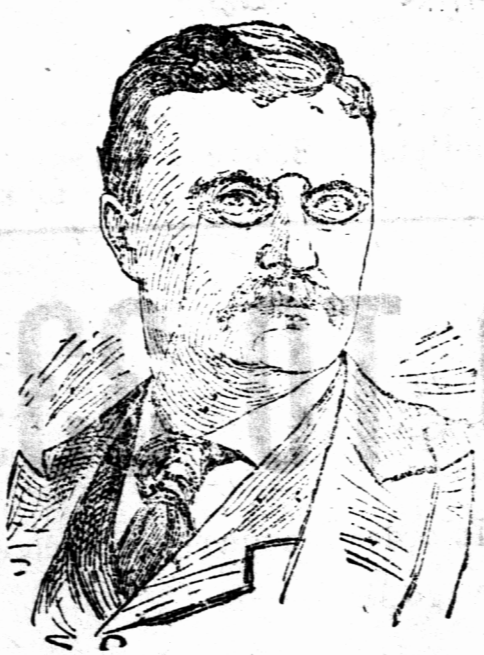
VICE PRESIDENT ROOSEVELT. Who Will be President if McKinley Dies.