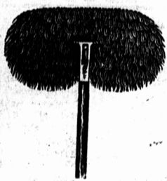
No. 1. REVERSIBLE MOP, chemically treated, a real labor saver for the busy housewife.

For prompt payments of instalments as they come due, Holman's will give ABSOLUTELY FREE WITH YOUR LAST PAYMENT on any of the above sets of dishes your choice of any one of the following: