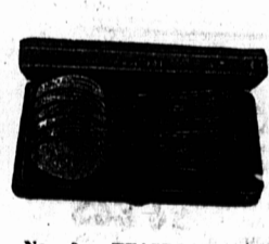
No. 3. TEASPOON SET comprising six silver plated teaspoons in nicely lined leather covered case.