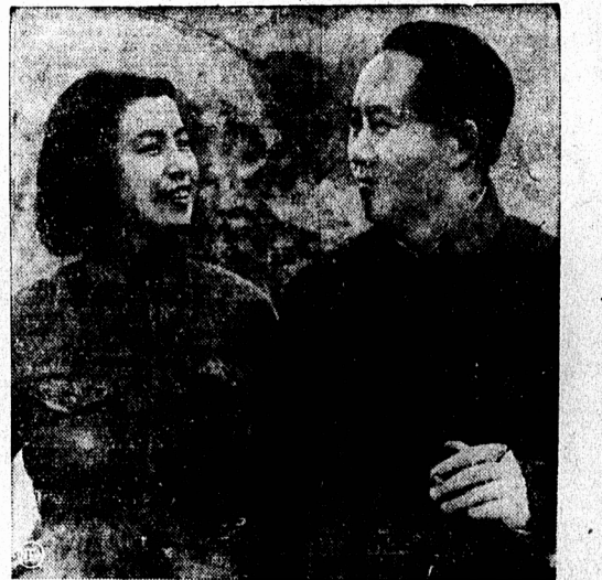
MAO TZE-TUNG, right, is Chairman of the Communist Party. His wife is the former Lan Ping, Shanghai motion picture actress.