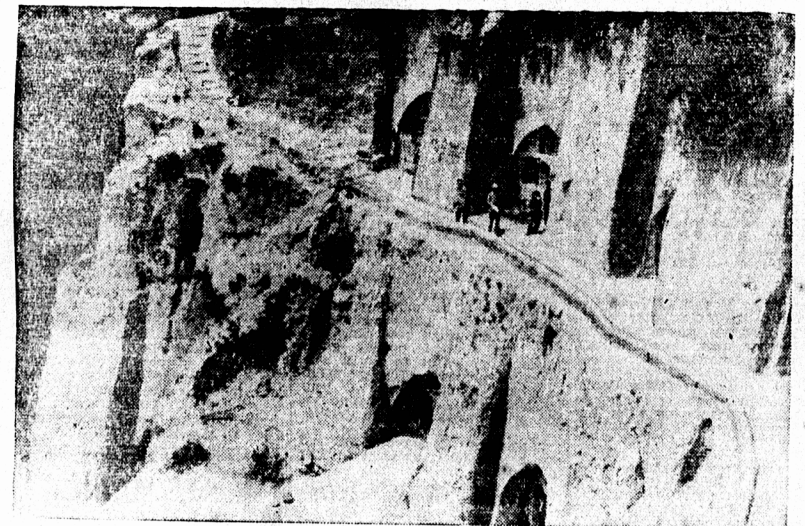
MILLIONS of people in Northwest China, home of the Communist Eighth Army, live in caves like these. Carved out of hard-packed loess soil, they are not-ab-proof, cool in summer, warm in winter.