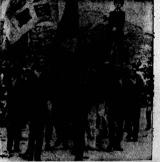
"LIVING NEWSPAPER" dramatizes D-Day in France. Eisenhower is portrayed by actor standing on deck of a human "battleship"