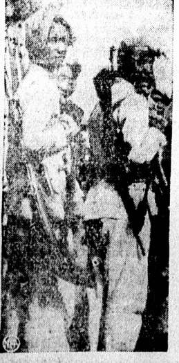
WEAPONS range from ancient tunderbuss to Jap Tommy gun.