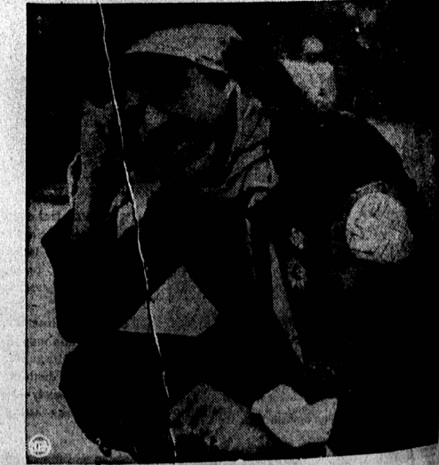
HITLER weeping over Eisenhower's D-Day successes is shown in "Living Newspaper" dramatization of the invasion.