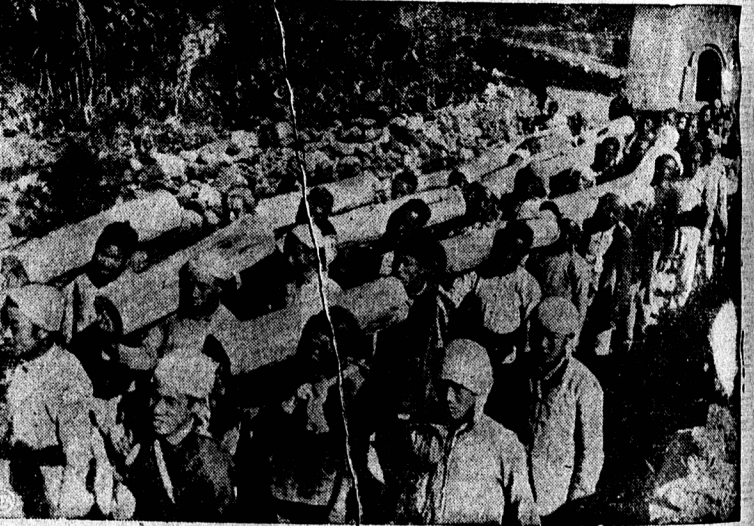
ALL KINDS of weapons are used by the 2,000,000 armed forces directed by the Communists. Wooden cannons are made of elm logs. They have metal.