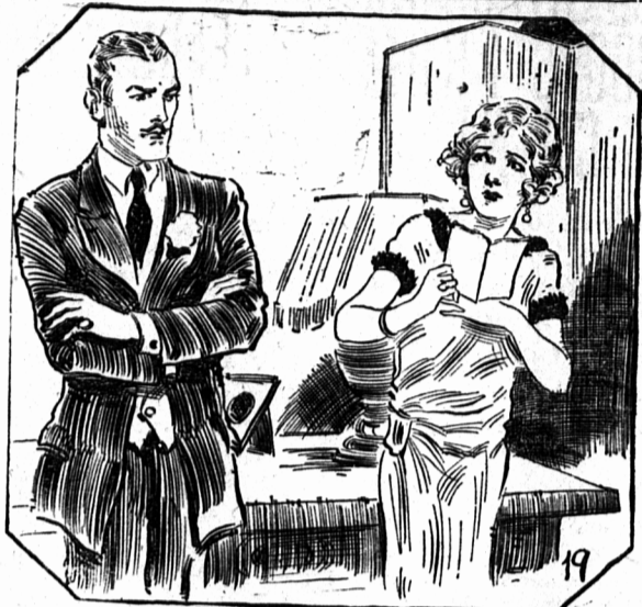
"You expect me to believe that you had ten thousand dollars to give away?"

Lila was giving a tea when Herbert reached home with fire in his head. He thought Dorothy de- eye. He was considerably surprised liberately brazen. It seemed to him that the guests tery throng of smartly gowned would never leave, and he grew more and more impatient for an interview with Lila. But, finally, he forced himself to chat amiably they began going, and the orches- with the guests, but his thoughts ceased playing. Herbert was