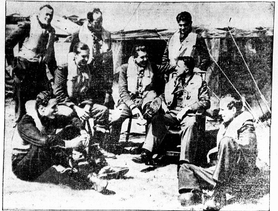
R. A. F. PILOTS TAKE A "BREATH"—Hard pressed in their battle against the overwhelming Nazi aerial blitz forces, British pilots take advantage of a slight lull in fighting. Pilot (seated right) tells of being shot down.