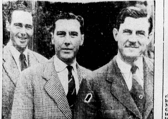
Well known to movie-goers in many screen roles, these three men heretofore will have every right to the navy blue uniform they will wear. They have been accepted by the R.C.A.F. as aviators...