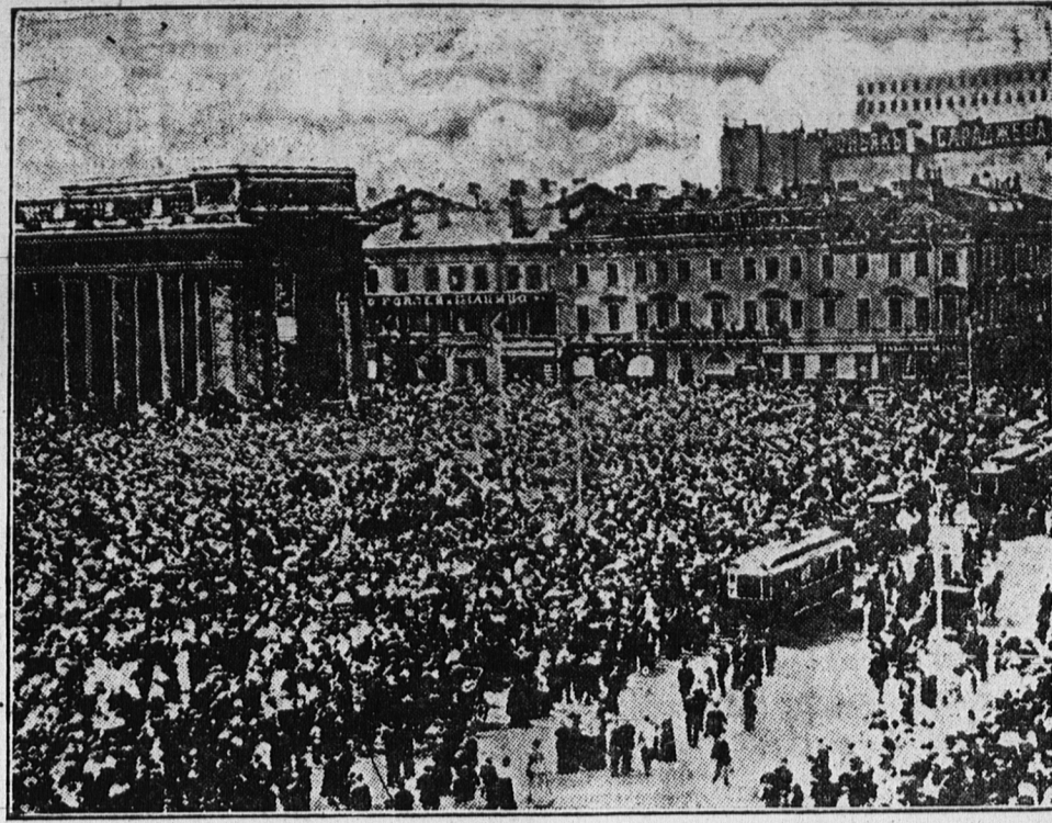
ALMOST A HORRIBLE TRAGEDY.

Office Hours: 9.30-12.30; 2-5. Evenings by Appointment. 2446, 10.7 Mm wtf. Phone 153-L.