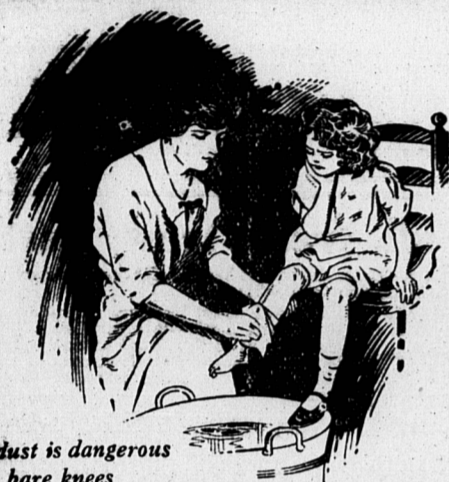
Street dust is dangerous on bare knees