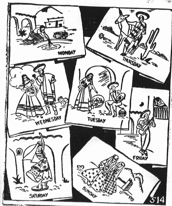
DESIGN NO. 514

Days-of-the-week with Mexican figures are embroidered on towels. Omitting the lettering, they are colorful little pictures to frame. Hot iron transfer pattern No. 514 contains seven motifs measuring about 5 1/2 by 6 inches each with complete instructions.