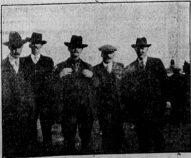
SOME FARMERS AT EXHIBITION.