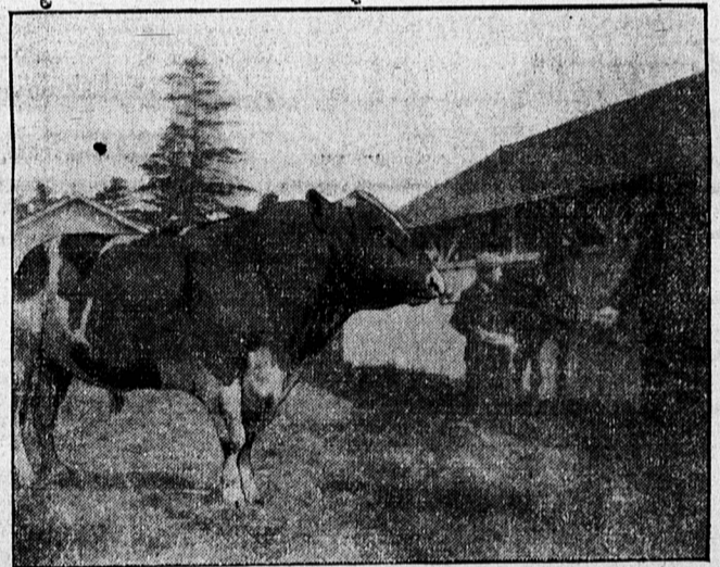
AN EXHIBITION PRIZE WINNER.