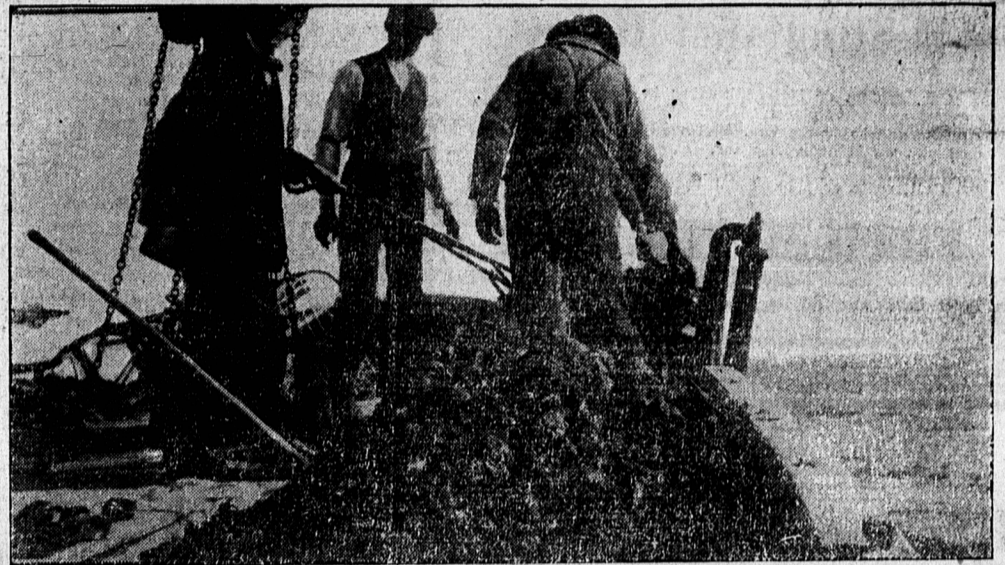
FISHING MALPEQUE OYSTERS.