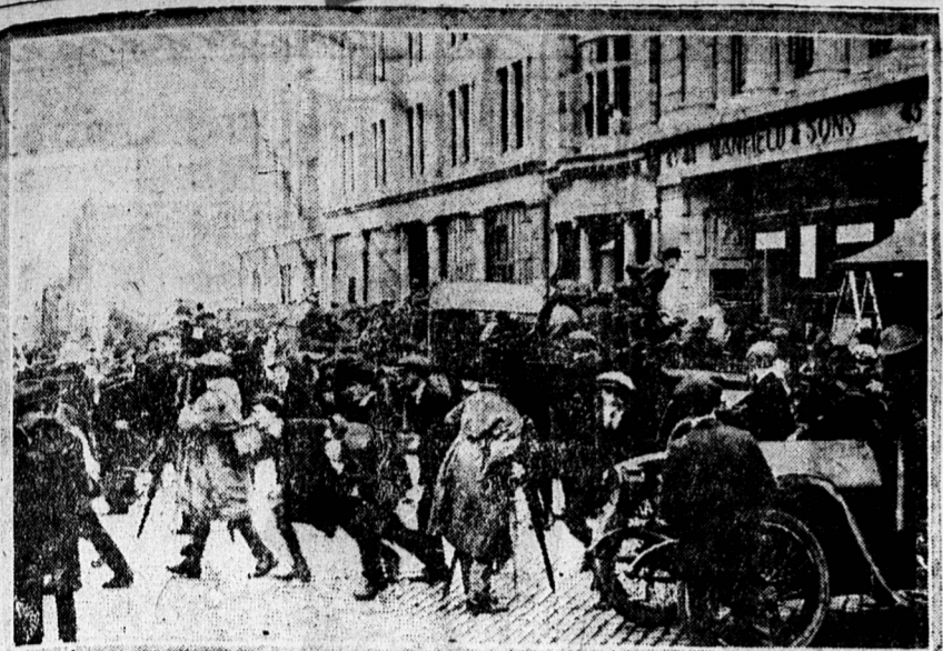
POLICE AND SOLDIERS MAKING RAID IN DUBLIN

Here is one of the latest photographs received from Ireland. It shows an exciting scene in Sackville street, Dublin, while combined forces of soldiers and police were making raids. A cadet on sentry duty is seen with revolver in his hand in front of the buildings raiding.