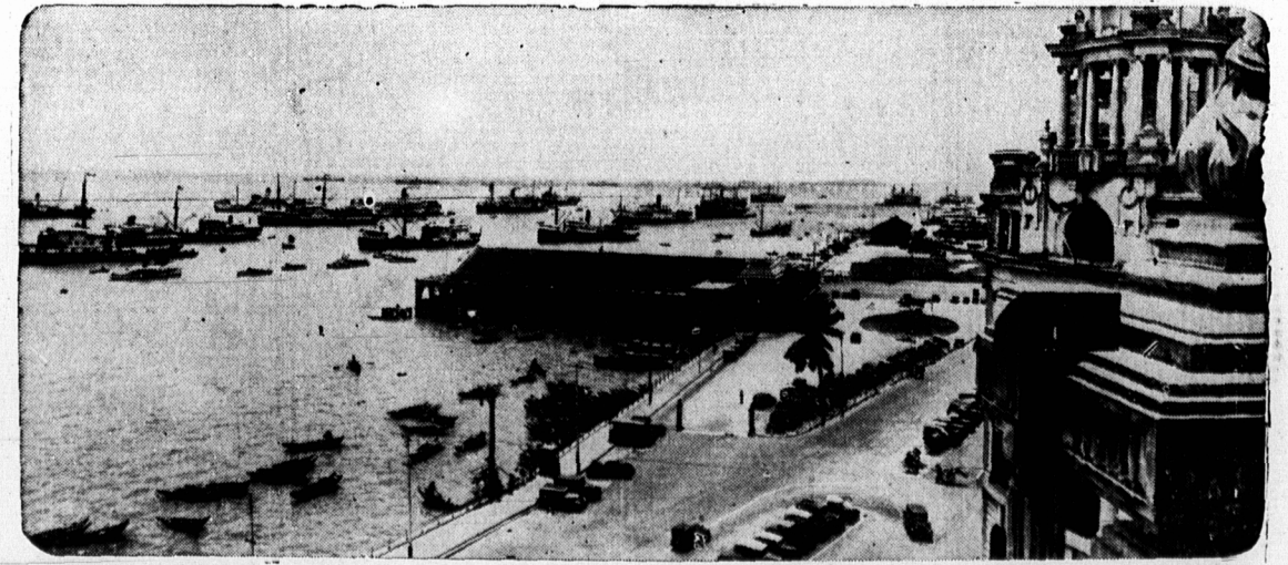
During recent conversations between the British Ambassador to the U. S., Lord Lothian; the Australian Minister, Hon. R. G. Casey; and the U.S. Secretary of State, Hon. Cordell Hull, the use of the huge harbor at Singapore as a base for naval ships was offered to the United States. Above is a view of Singapore Harbor. (LEFT), Inside breakwater; (CENTRE), Clifford Pier; (RIGHT), Hong Kong and Shanghai bank building.