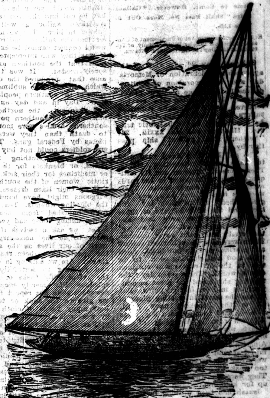
THE NEW CHALLENGER.