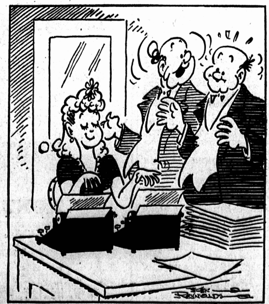
"We used two Guardian Want Ads — and she answered both of them!"