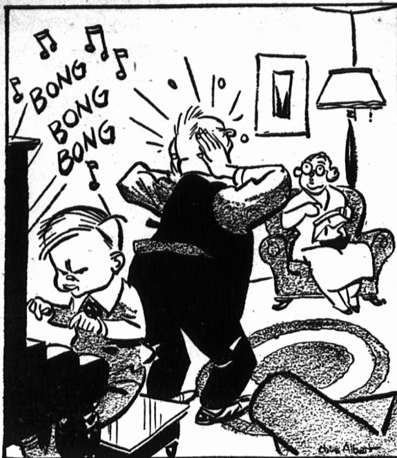
"From now on use Surprise Soap... we can get a nice quiet mouth-organ—FREE—by saving the coupons!"