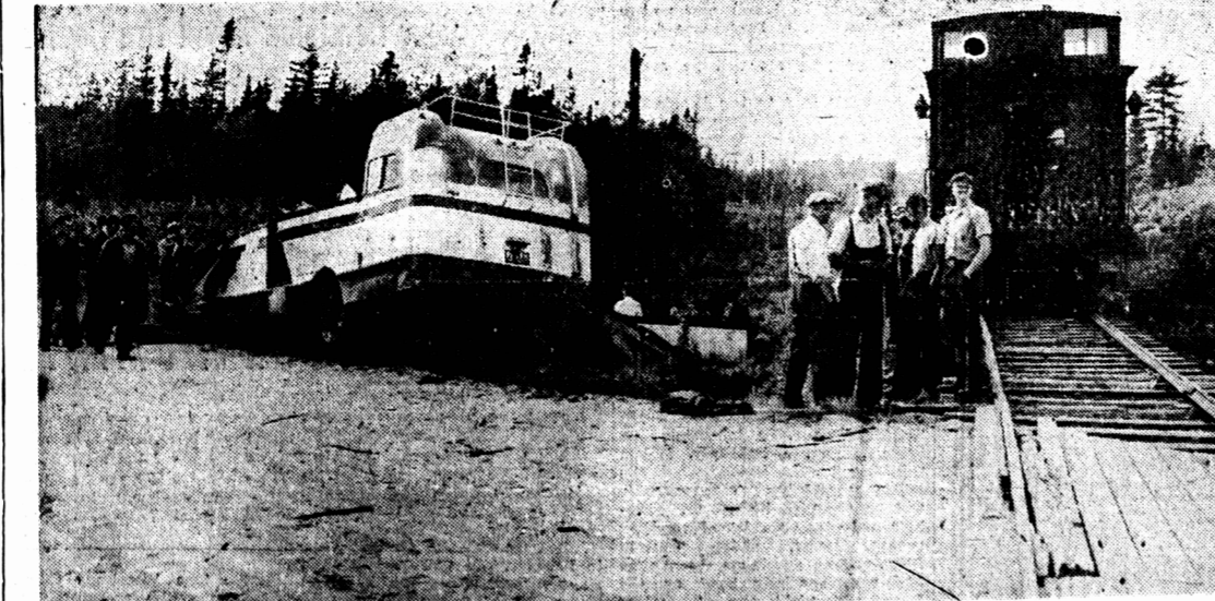
A general view of the Murray River Road level-crossing accident Saturday in which four people were killed. The bus was completely turned around and demolished. The railway engine was derailed. The crossing is on a slight elevation of ground and the view somewhat restricted by the growth of bushes.