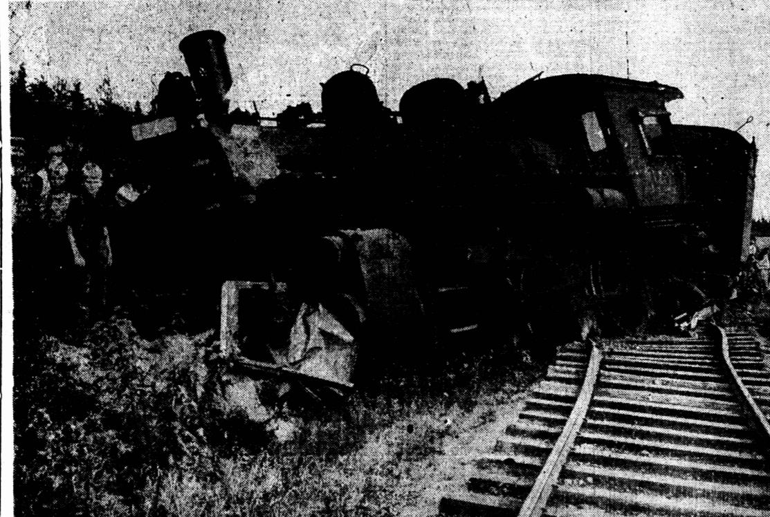
The derailed engine No. 1146 of the extra freight which was involved in the train-bus crash at the Murray River Road crossing accident Saturday afternoon. Track and rails were torn-up to a distance of 120 feet. The front door of the bus can be seen. Crew members escaped injury. They were unaware of the approaching bus until an instant before the crash. The train was made-up of a carload of lumber and caboose which was en route to Charlottetown from Murray Harbor.