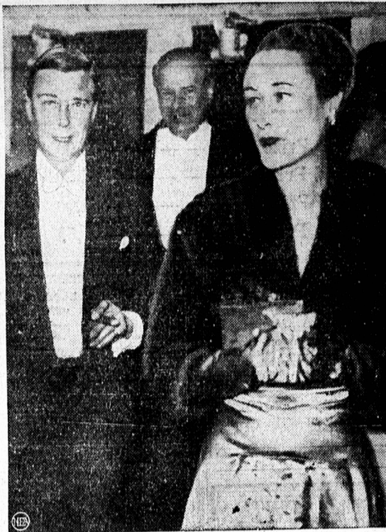
What are the Duke and Duchess of Windsor doing these days? Well, for one thing they're going to the movies just like other folk. The duke, cigar in hand and smiling, is pictured with his lady, arriving for a Danielle Darrieux premiere at a Paris theatre.