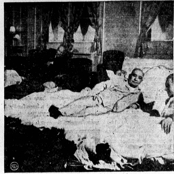
Passengers on the burning German liner Deutschland, which caught fire 200 miles off Cape Race, Newfoundland, refused to get panicky during the 10-hour fight to control the blaze. Pictured are third-class passengers who spent the night on improvised beds in the ladies' tourist class parlor after smoke drove them from their staterooms. Capt. Karl Steineke brought the ship to port without a casualty. There were no pictures of the blaze.