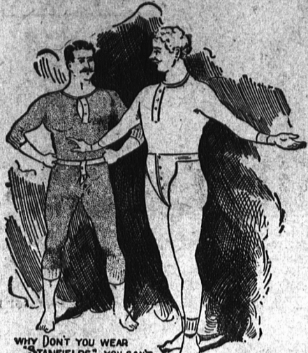
WHY DON'T YOU WEAR STANFIELD'S YOU CAN GET THAT SUIT WASHED AGAIN.