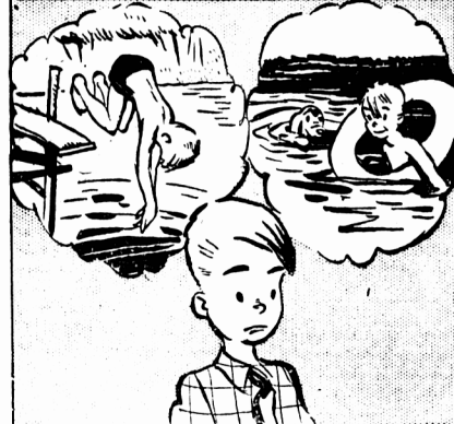
These are the months of learn and teach— (Gone, for awhile, are the lake and the beach.)