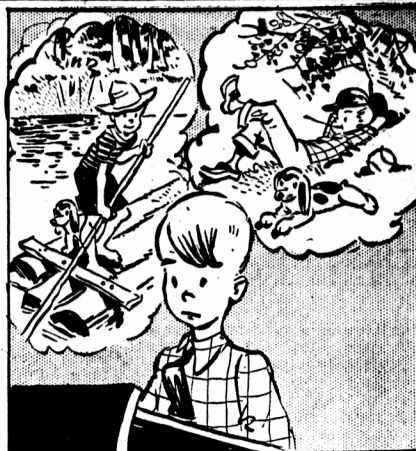
This is the season of lesson and test— (Forget the joys of that all-summer rest.)