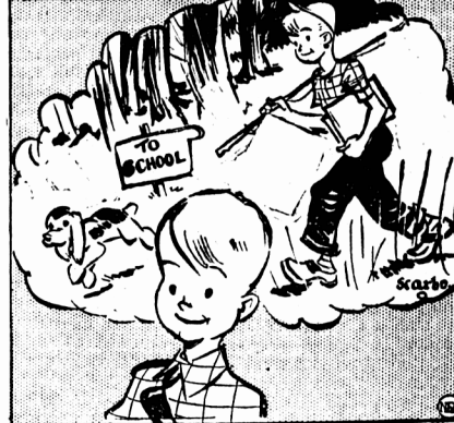
Now is your chance to be smart and booky— (Come to think of it, there's always hooky.)