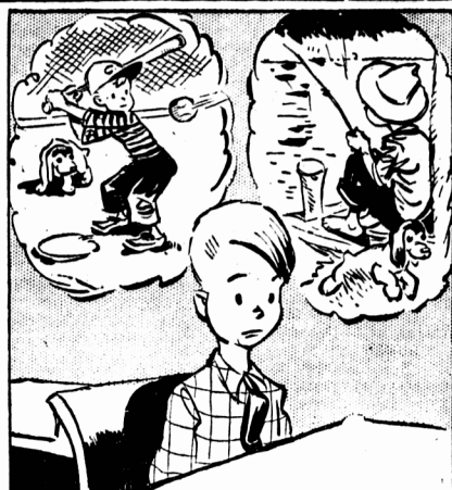
These are the times that try kids' souls— (Put down those bats and fishing poles.)