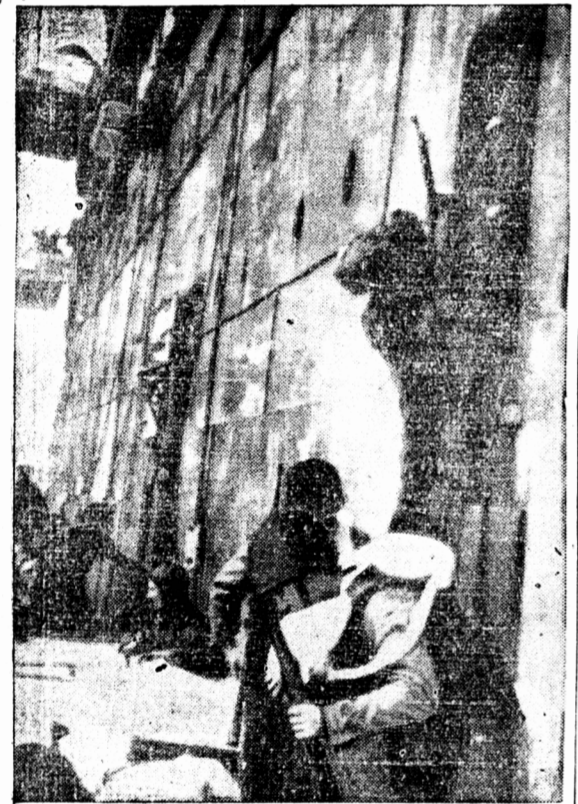
B. was "destination unknown" when these American soldiers boarded ship at an undesignated port of embarkation. But they soon discovered they were part of the greatest invasion armada in history, which included a protective circle of battleships and other heavy warcraft, carriers, transports, swift motorboats and landing barges. The men did not know their destination until a few hours before they clambered into the barges for the great assault of North Africa.