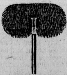
No. 1. REVERSIBLE MOP, chemically treated, a real labor saver for the busy housewife

For prompt payments of instalments as they come due, Holman's will give ABSOLUTELY FREE WITH YOUR LAST PAYMENT on any of the above sets of dishes your choice of any one of the following:—