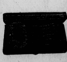
No. 3. TEASPOON SET comprising six, silver plated, teaspoons in nicely lined leather covered case.

Remember the Dates— June 8th to June 16th —and ORDER EARLY