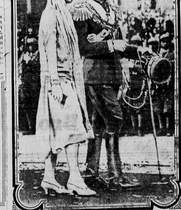
Announcement of the engagement of Crown Prince Humbert of Italy to Princess Marie Jose of Belgium is imminent, according to latest despatches. The above photo shows a recent photo of the pair taken while they attended a wedding in Rome, Italy.

"Among the few great pianos of the world," is the way musical celebrities voice their opinion of the Heintzman & Co. Piano. Its warm and sympathetic tone has earned the approval of musicians claiming both local and international fame. Visit our Music Salons and inspect the various models. An illustrated catalogue with price list will be sent you on request.