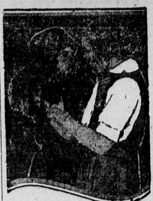
Scene from "THE FLIRT" UNIVERSAL-JEWEL PICTURE WITH AN ALL-STAR CAST