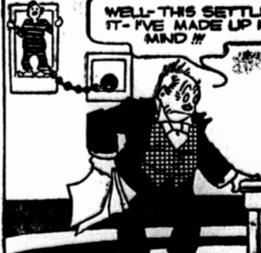
BRINGING UP FATHER