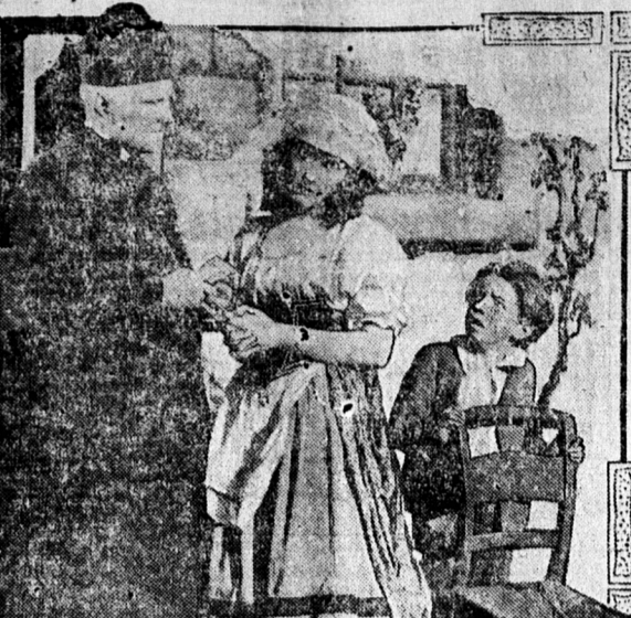
SCENE FROM "MY WILD IRISH ROSE" In "My Wild Irish Rose," Pauline Starke has one of the most appealing roles of her whole career. As Moya, the old priest's niece and housekeeper, she gives a delightful interpretation of a dainty, young Irish colleen. Moya falls in love with Conn the Shaughraun, the last being a local name for scapgrace and ne'er-do-we', and Father Dolan frowns on the match. In the end it is Conn's heroism and self-sacrifice that save the day all around.