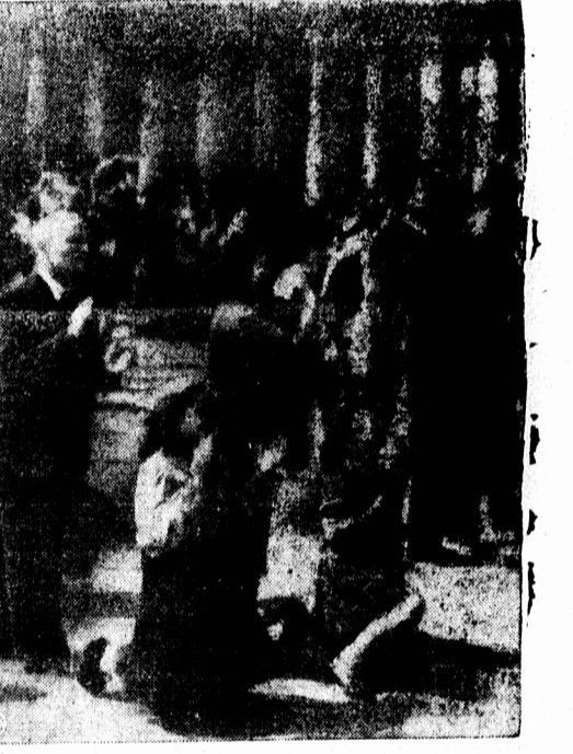
Their hands clasped in prayer and happy smiles lighting up their faces, Roman stand in St. Peter's Square and join with the Pope in a prayer of thanks for their liberation from the Nazis.