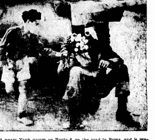
A weary Yank pauses on Route 6, on the road to Rome, and is presented with flowers by an Italian youth—a means of expressing his gratitude to one of the liberators of Rome. Triumphant 5th Army troops have entered Rome and smashed to the heart of the German City, driving German rear guards in disordered flight to the northwest.