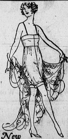
New Kickernick Fitted-top Combinette

With cuff knee. Women of taste will find real joy in this "two-in-one" garment. A perfect-fitting, beautifully tailored brassiere-like top with bloomer portion pleated on and falling in lines of grace to a cool, open knee. In fabric of cottons or purest of silks.