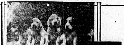
For nearby subjects when the light is not very bright as in the picture above, use a wide lens opening.