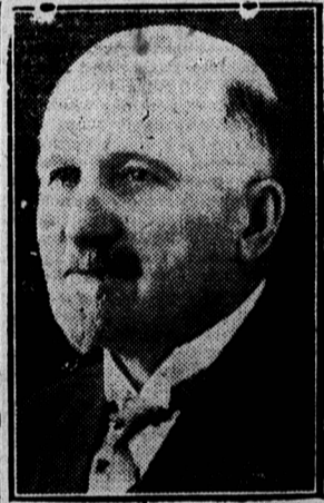
Hon. W. H. Motherwell, Minister of Agriculture, Honorary Chairman, World's Poultry Congress, to be held at Ottawa from July 27 to August 4th.

HAZEL GROVE SCHOOL. This following is the standing of Hazel Grove School for the month of June.