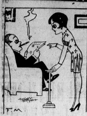
IN THE BEST ROOM

Hubby (constant smoker): Can you believe that all that remains of a man is a little dust? Wife (pushing ash-tray toward him): No—his remains are principally ashes, I'd say.