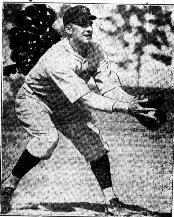
Third sacker for the Cleveland team, snapped in a characteristic attitude as he gathered in a hot throw from second.