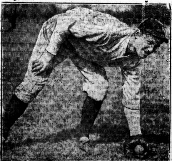
The snappy infielder for the New York Yankees is doing some splendid hitting to keep the Mack men at the top of the league.