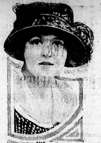
MARGUERITE CLARK in 'Little Miss Hoover' A Paramount Picture

She's one little witch we all adore. Marguerite Clarke. Eyes like fairy pools. Lips like a new born rose. Smiles like sunbeams. You know one PERSON who will see her.