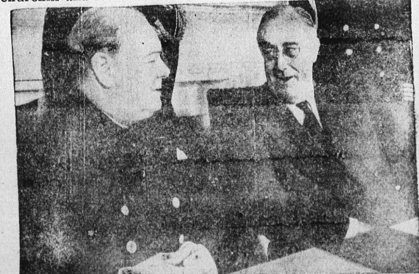
Allies' Victory Plan Charted at White House, Washington

Churchill and Roosevelt Plan World-Wide Defeat of Hitlerism