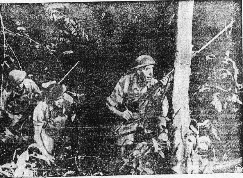
N. B. Soldier Wounded in Shooting affray

These are important right now, for while Manila, unlike Singapore, is not equipped as a major fleet base, it is a submarine base. And our submarines are among the world's best.