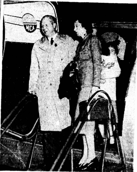
Colonel and Mrs. George A. Drew, as they stepped off the plane here on Sunday evening. They left yesterday by plane for Halifax after a busy day in Charlottetown Monday.